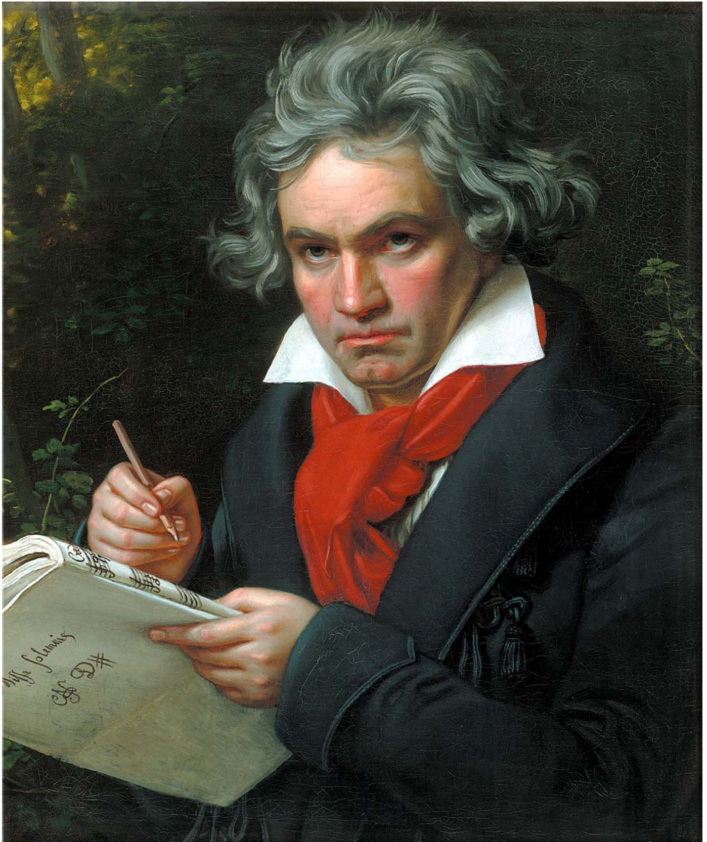
LUDWIG VAN BEETHOVEN 1770-1827